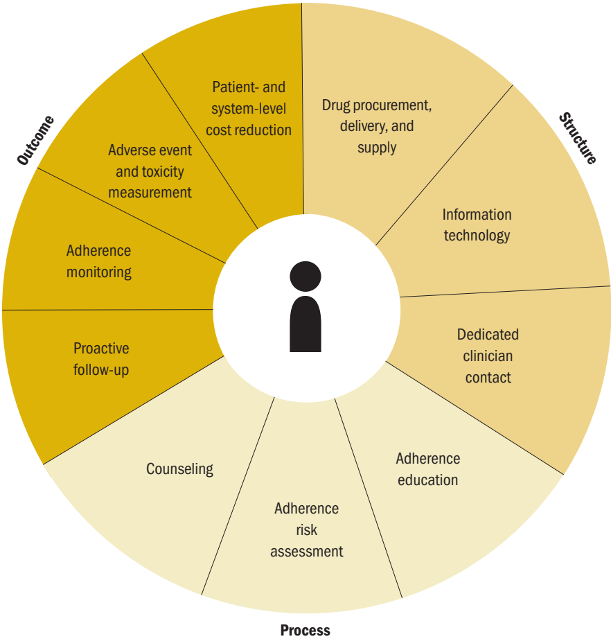
FIGURE 2. Scoping Review Model

This scoping review identified 20 distinct OAM programs reported in the literature, which included an aggregate of 10 components aimed at improving patient adherence. The programs included