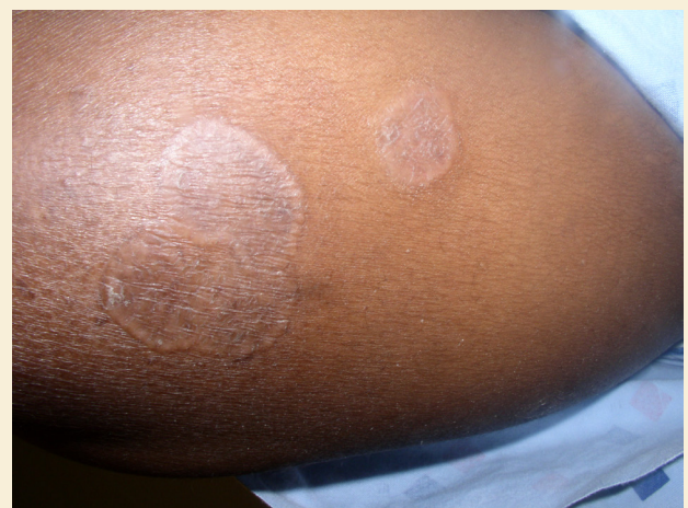
FIGURE 4. Case Study 4 Patient

In July 2011, the patient was diagnosed with MF-CTCL stage Ib (T2N0M0B0); a skin punch biopsy from a patch on her