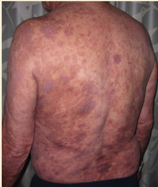
FIGURE 3. Case Study 3 Patient

Note. Photographs courtesy of Dana-Farber/Brigham and Women's Cancer Center. Used with permission.