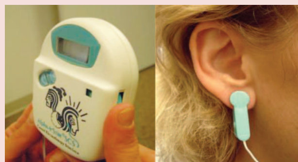
Note. Ear clips are worn on both ears.

The institutional review boards of the University of Virginia and Virginia Commonwealth University approved