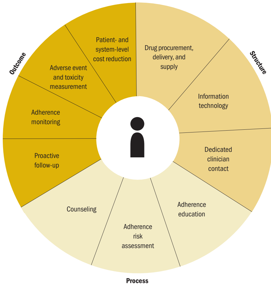
FIGURE 2. Scoping Review Model

This scoping review identified 20 distinct OAM programs reported in the literature, which included an aggregate of 10 components aimed at improving patient adherence. The programs included