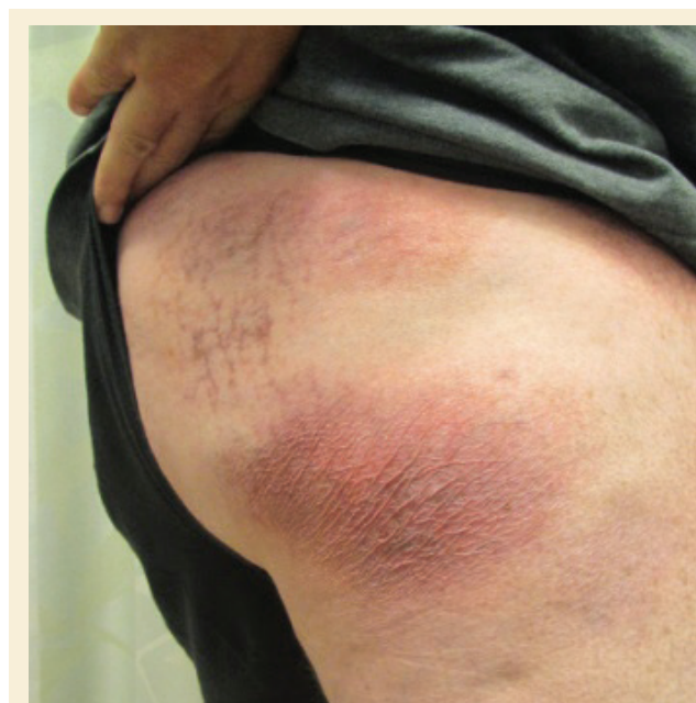
FIGURE 1. Case Study 1 Patient

At the time of this writing, the patient has tolerated treatment for five months with no dermatitis. The patches have faded, smoothed, have a mild-brawny hyperpigmentation, and