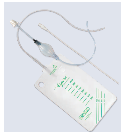
Figure 2. Aspira® Drainage System

Complications of performing a paracentesis are low but include infection or peritonitis, intestinal perforation, hypoproteinemia, hypotension, and pulmonary embolus (Chung & Kazuch, 2008). The ascites reaccumulate in an average of 7–10 days, requiring repeated paracenteses, which exposes the patient to repeated risk of complications and numerous trips to the hospital for the procedure (Becker, Galandi, & Blum, 2006). Diuretics and a low-sodium diet can help reaccumulation, but have been found to be effective only in those patients who have ascites from portal hypertension and liver metastases, which is about one-third of all cases (Cavazzoni, Bugiantella, Graziosi, Franceschini, & Donini, 2013). Portal hypertension results in elevated levels of plasma renin and aldosterone, which can respond to spironolactone and furosemide. The recommended dosages to begin are 100