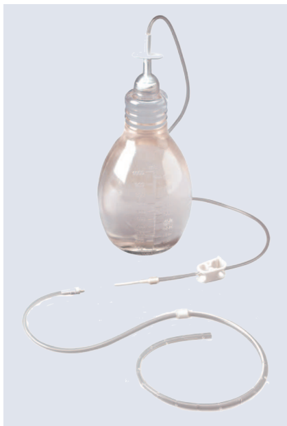
Figure 3. PleurX ® System

Note. Image courtesy of CareFusion Corp. Used with permission.