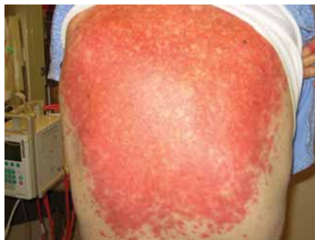
Figure 2. Severe Skin Rash

be present, particularly in the lower legs (see Figure 3). The lesions are erythematous and frequently become confluent. The distribution is symmetrical and almost always on the trunk and extremities. Acral erythema is characterized by erythematous patches on the palms or soles and on the digits (Kossard, 2000; McCarthy, 2002; Rest & Horn, 1992).