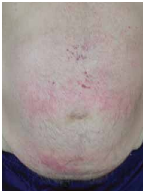
Figure 1. Mild Skin Rash

Fitzpatrick, Johnson, Wolff, Polano, and Suurmond (1997) described skin rashes as adverse cutaneous drug reactions or drug eruptions that are further classified into four hypersensitivity types. The rashes discussed in the present study are consistent with type IV, a cell-mediated immune reaction, and include the morbilliform or maculopapular (exanthematous) reactions. According to Fitzpatrick et al., drug eruption may occur at any time between day one and three weeks after beginning treatment, patients may have fevers, and rashes are usually pruritic. The skin lesions are macules and/or papules, and purpura may