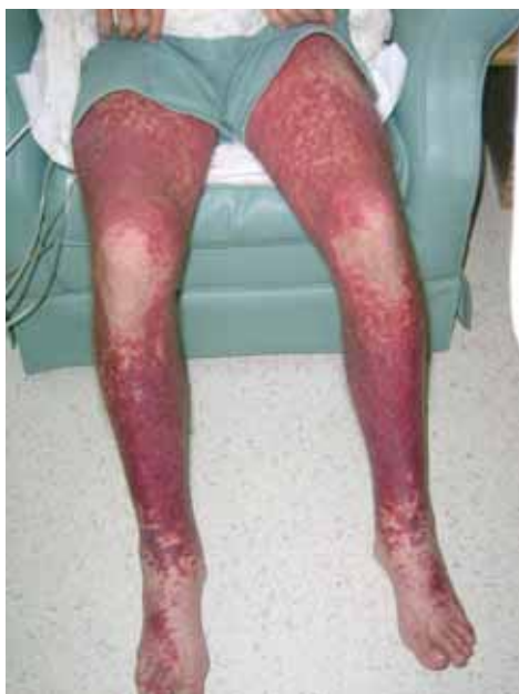
Figure 3. Purpuric Rash on the Legs

including patients' diseases, types of chemotherapy protocol, adjuvant medications, and allergies. On the manifestation of a skin rash, further data were collected regarding the distribution and description of each rash, any newly introduced drugs (e.g., antibiotics), and blood counts. These data were collected on all 14 patients while they exhibited a rash.