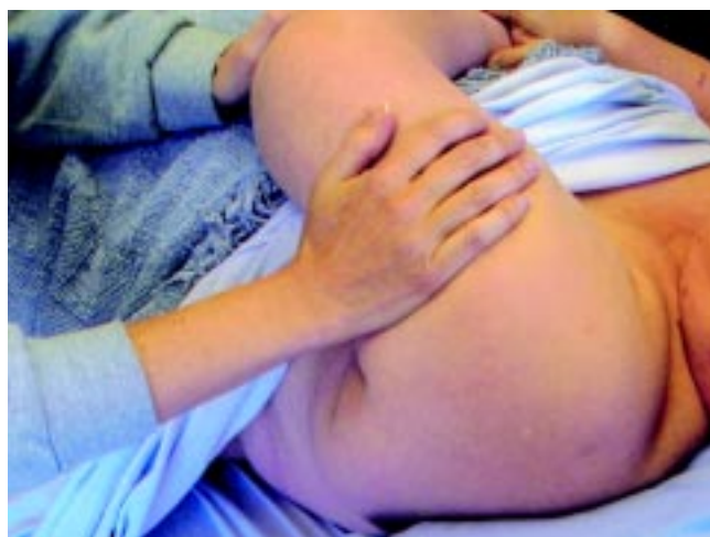
Figure 5. Stretching Skin Perpendicular to the Lymph Pathways Running From Elbow to Shoulder

In Figure 5, the left axilla is affected because of axillary node dissection and subsequent left arm lymphedema has