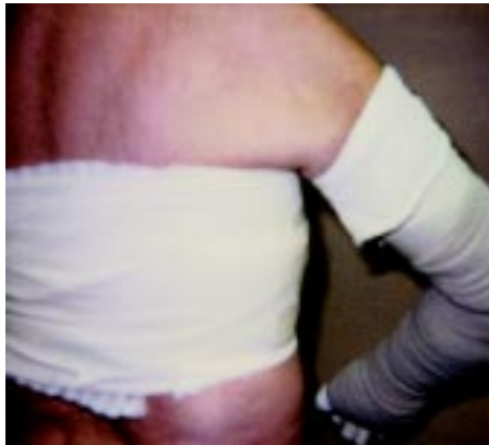
Figure 8. Compression Bandaging

size of the limb at its lowest size following MLD treatment. Standard compressions range from 15–50 mmHg. The greatest compression is at the most distal point(s) of the garment with a gradual decrease moving proximally. Compression garments are intended to prevent increased swelling and should be worn only during the day (Brennan & Miller, 1998; Cheville, McGarvey, Petrek, Russo, Taylor, et al., 2003).