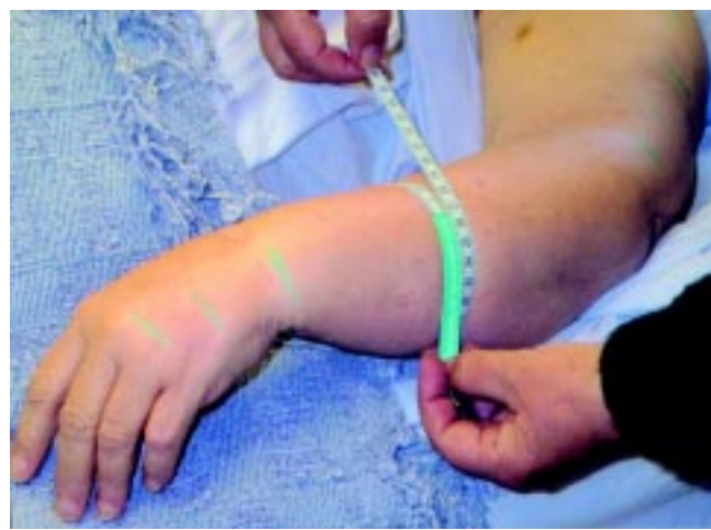
Figure 3. Circumferential Measurement

The pathology report of the original cancer tissue diagnosis usually must be requested by the lymphedema practitioner because it typically does not accompany a physician referral. Providing the practitioner with information about the type and