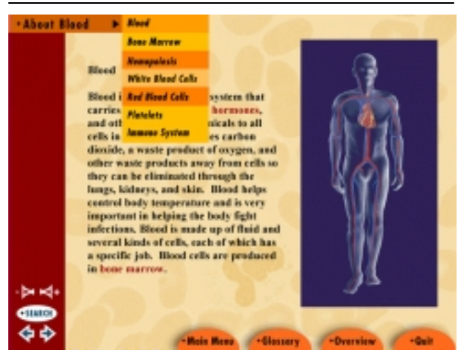
Figure 2. Screen Shot Showing Seven Submenu Sections in the “About Blood” Section of the Bone Marrow Transplantation CD-ROM

where in the program. Audio buttons allowed users who prefer reading to turn off the narration.