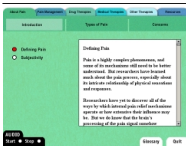
Figure 3. Screen Shot Showing Tab Format Navigation in the Chemotherapy CD-ROM

Another barrier to widespread use of the programs has been staff. Some nurses have been concerned that the programs would usurp their role as patient educators. Some have been